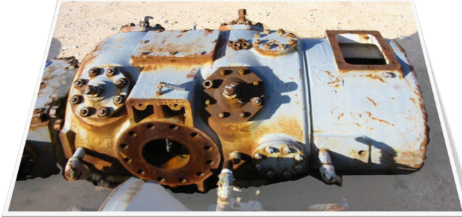
Available Used Cylinders Identified

Significant cost-savings can be achieved when refurbishing existing compressor cylinders versus buying new ones. With over 300 cumulative years of reciprocating compressor experience, ACI is simply the best source for reapplication, revamping or upgrading existing compressor equipment. Efficient and proven design philosophies are incorporated into each reapplication, whether using new or refurbished equipment.